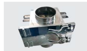
带套管易清洁式 Drawer with Quick Cleaning Tube