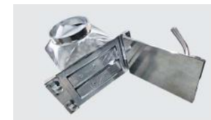
双层带门密封 Double Layers with Door