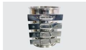
4层抽屉式 4 Layers Magnetic Drawer