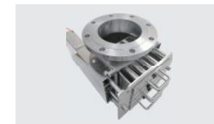
气动自清洁 Pneumatic Self Cleaning