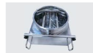
双层易清洁 Double Layers EZY Cleaning